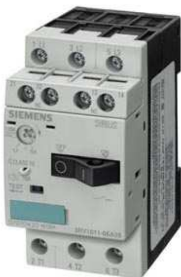
CIRCUIT-BREAKER SIZE S00, FOR MOTOR PROTECTION, CLASS 10, A-REL. 2.8...4A, N-REL. 52A, SCREW TERMINAL, STANDARD SWITCHING CAPACITY, W. TRANSV. AUX. SWITCH 1NO+1NC